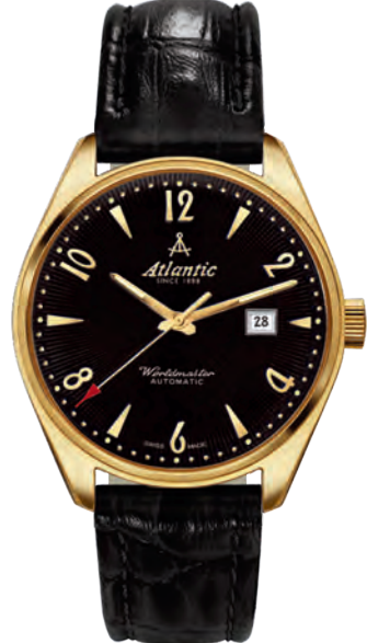
51752.45.65G | Automatic