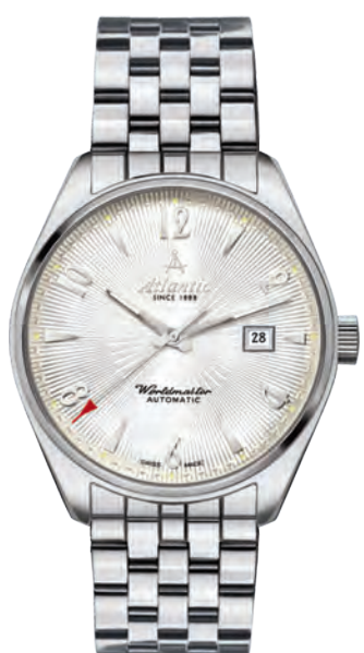
51752.41.25SM | Automatic