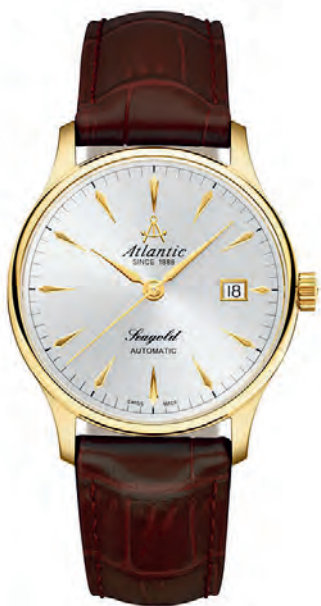
95743.65.21 | Automatic