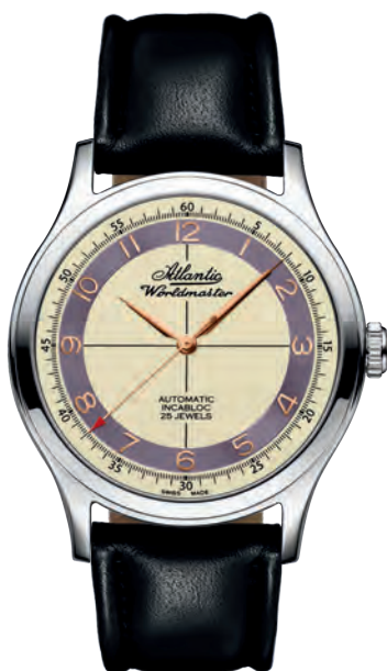
53754.41.93RB | Automatic