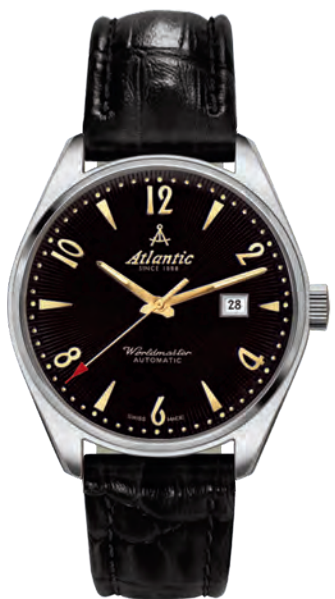
51752.41.65G | Automatic 51651.41.65G | Mechanical