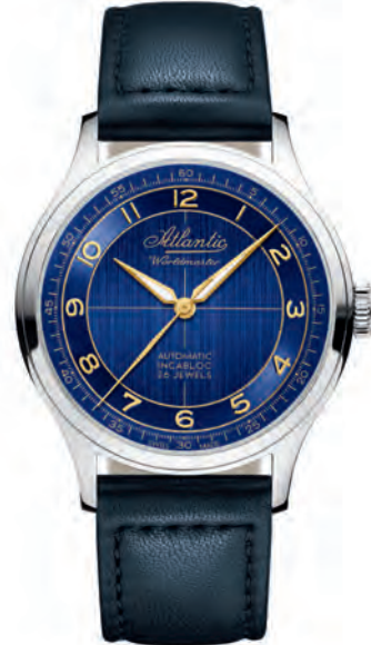
53780.41.53G | Automatic