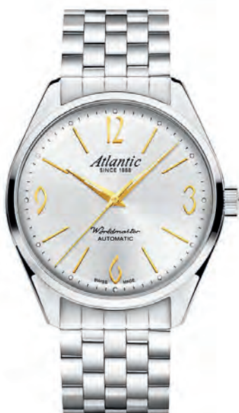
51752.41.29GM | Automatic