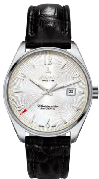
51752.41.25S | Automatic 51651.41.25S | Mechanical