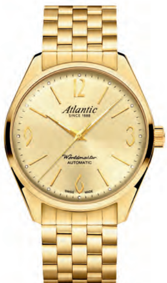
51752.45.39GM | Automatic