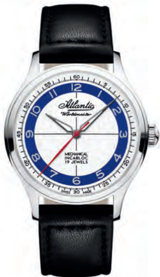
53680.41.13 | Mechanical