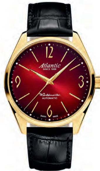
51752.45.99G | Automatic