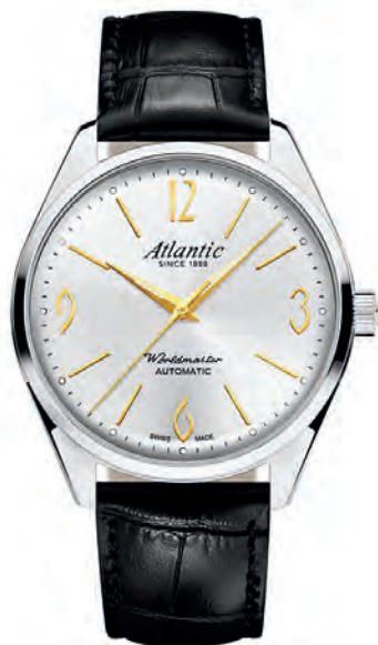
51752.41.29G | Automatic