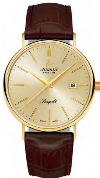
95344.65.31 | Quartz