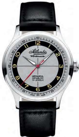
53680.41.23 | Mechanical