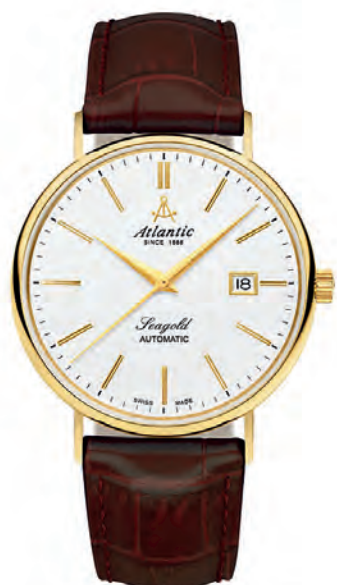
95744.65.11 | Automatic