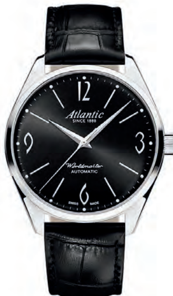
51752.41.69S | Automatic