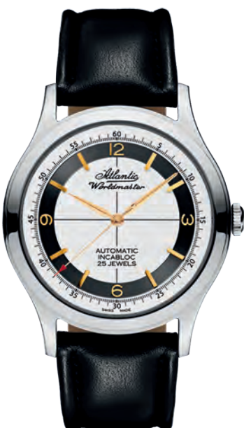
53754.41.25G | Automatic