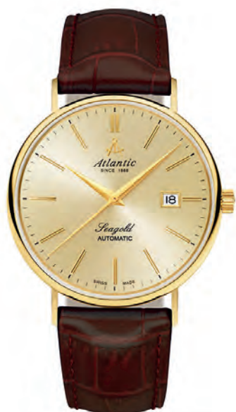
95744.65.31 | Automatic