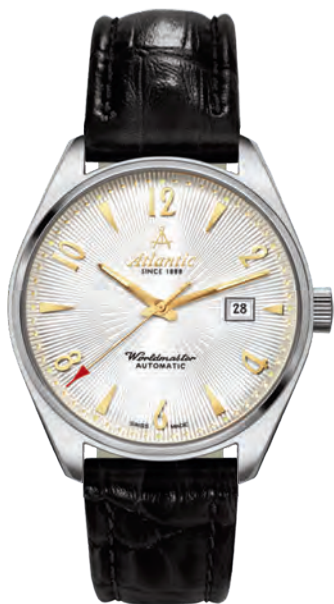
51752.41.25G | Automatic 51651.41.25G | Mechanical