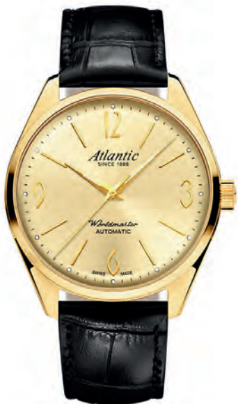
51752.45.39G | Automatic