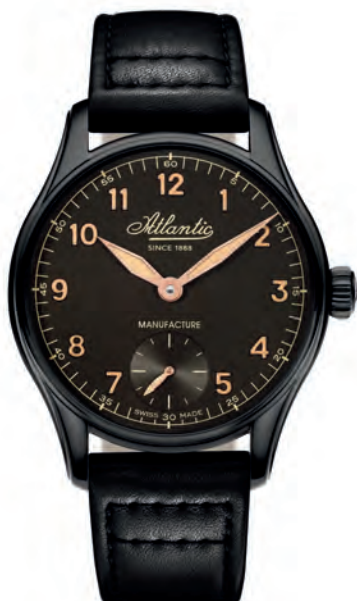
52952.46.63R with black leather strap