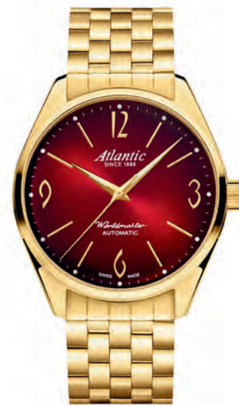
51752.45.99GM | Automatic