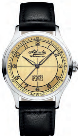
53780.41.39BK | Automatic