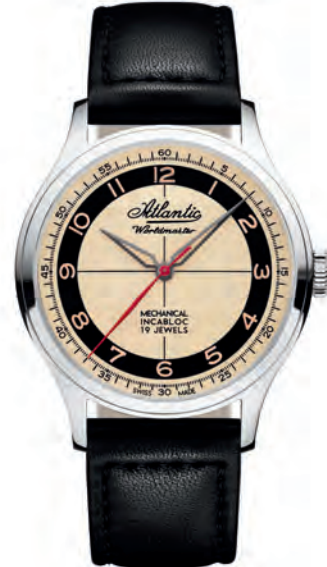
53680.41.93 | Mechanical