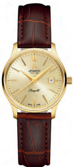
94342.65.31 | Quartz