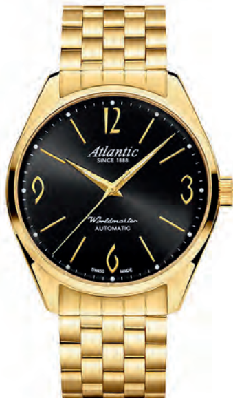
51752.45.69GM | Automatic