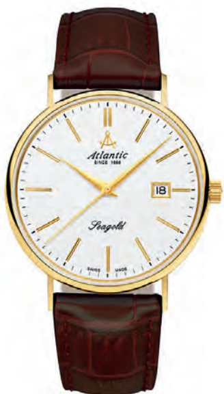
95344.65.11 | Quartz