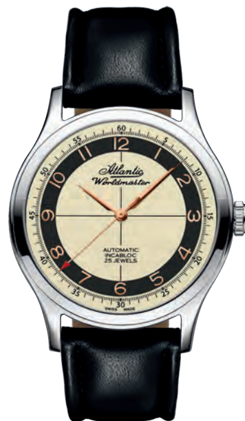
53754.41.93.RBK | Automatic