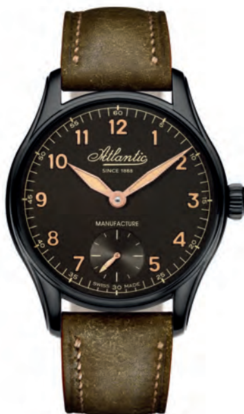
52952.46.63R with second leather strap