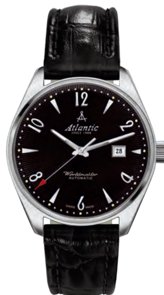
51752.41.65S | Automatic 51651.41.65S | Mechanical