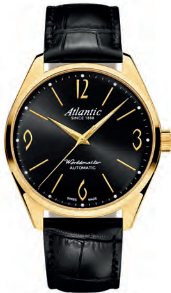
51752.45.69G | Automatic