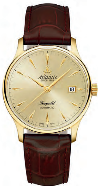
95743.65.31 | Automatic