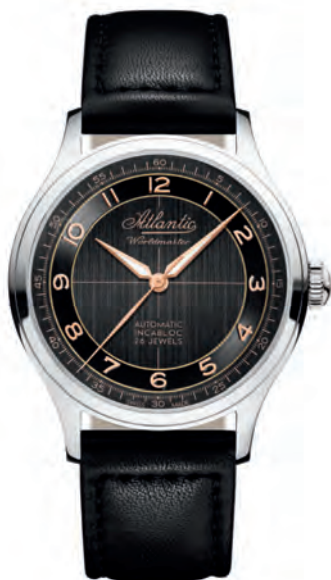
53780.41.43R | Automatic