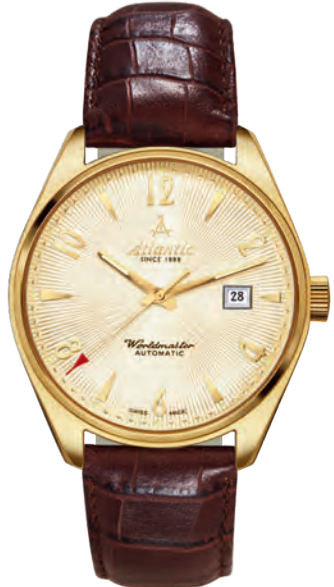
51752.45.35G | Automatic 51651.45.35G | Mechanical