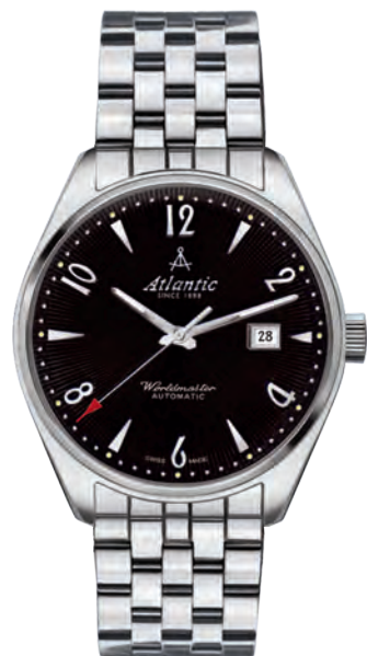
51752.41.65SM | Automatic