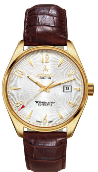
51752.45.25G | Automatic 51651.45.25G | Mechanical